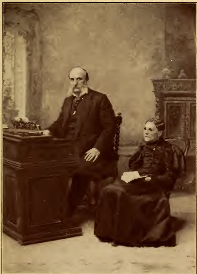
Two Famous Hymn-Makers Fanny Crosby and Ira D. Sankey